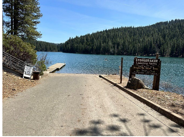
Stonebraker Boat Launch Ramp