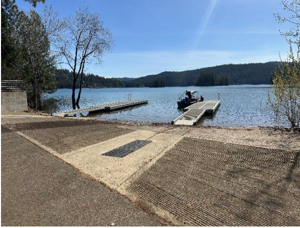
John T. Doolittle Boat Launch Ramp